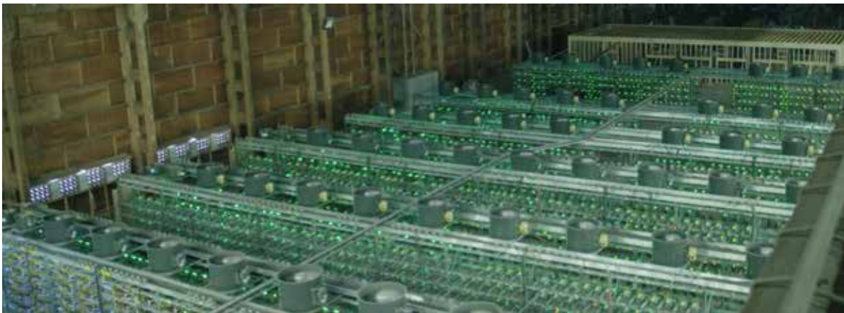
HASHPower: A RECENT IMAGE OF THE ORMEUS INDUSTRIAL MINING OPERATION IN THE USA.

The mining units include AC Air Cooled Mobile Datacenters. There are 179 miners in each 40-foot mobile data center, with each miner capable of working at up to 7.5PH/s of computer power served through 16nm ASIC. These containerized and modular mining units can be moved if required and sold on the secondary market for liquidation or ownership transfer.