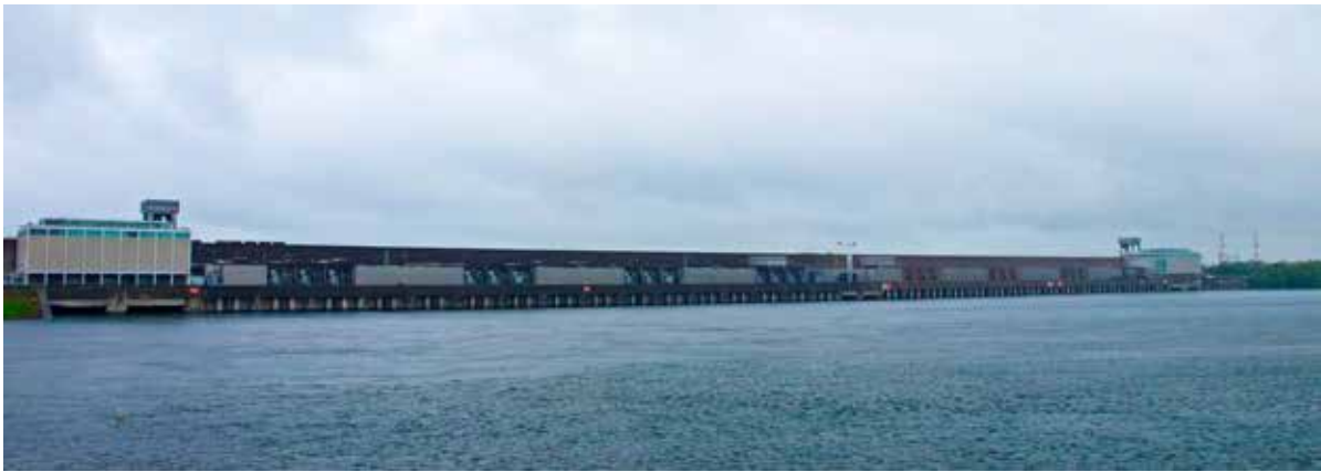
ORMEUS COIN EXPANDS WITH COST-EFFECTIVE POWER FROM HYDRO DAM ON AMERICAN/CANADIAN BORDER

Verified reports show that Ormeus has data centers in upstate New York, the American Mid-West, and has acquired new centers in China. Each of these facilities has secured long-term energy contracts. For example, the New York facility is using renewable energy from a hydro dam near the Niagara Falls on the American/Canadian border. It has collaborated with local authorities and the Moses-Saunders Power Dam, a colossal hydro project across the St. Lawrence River Valley. The hydro dam has 32 turbine generators, with 912 MW being operated from Massena (US) and 1045 MW run on Canadian side.